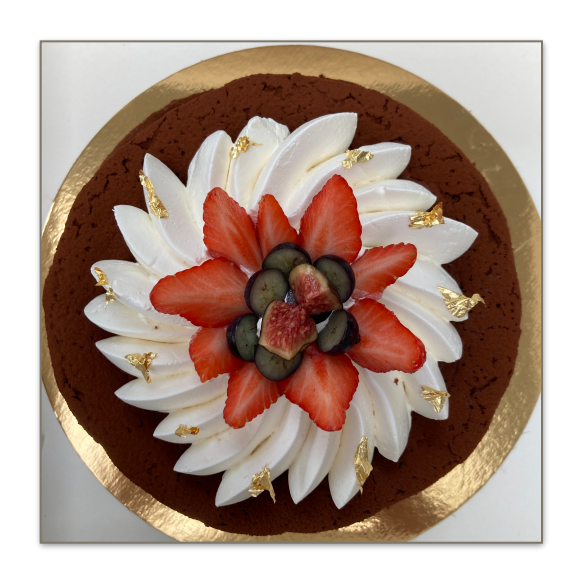
Please contact us for any celebration cake design from 12 to 50 portions

VAT is not included and roll bread is £0.45 per roll Our prices include chef service from 6 to 15 people